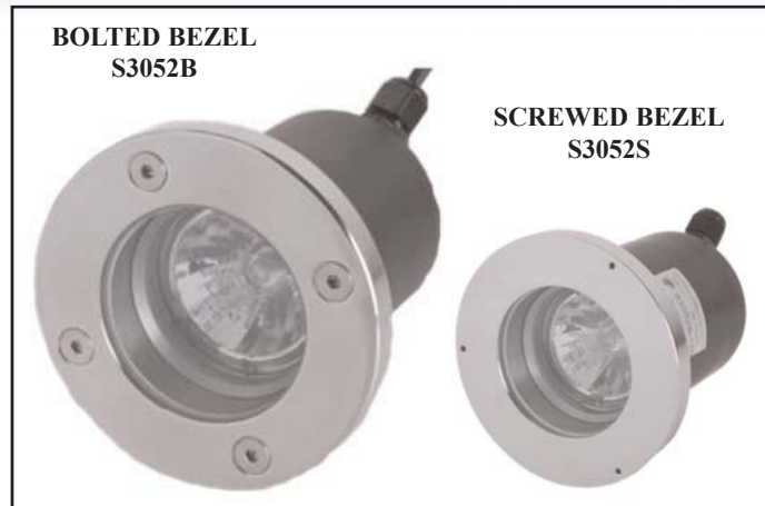
Dimension for surface fitting

For additional information please visit our web site.