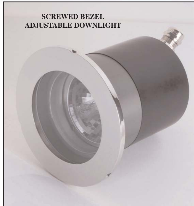
Dimension for 150w HID and 75w halogen

The arrangement with the low voltage halogen has an integral transformer which can be removed if necessary.